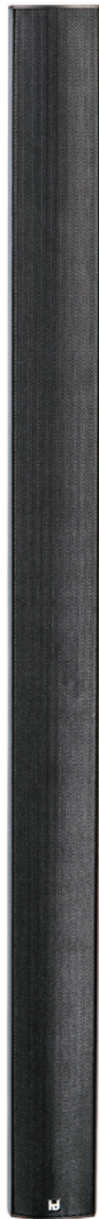
hd PL16 PowerLine Stick